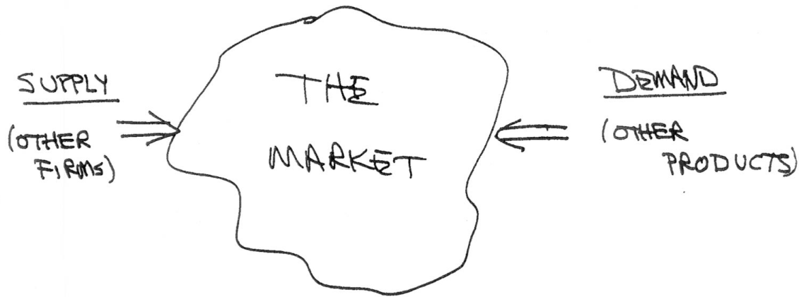
Figure 1: Market Boundaries

a single market for bicycles, or does it make more sense to think of “private label” bicycles (bicycles made by Huffy and Schwinn, for example, that are sold in stores such as Target and Wal-Mart) as belonging to a separate market from the more expensive bicycles (Giant, Cannondale, Trek, etc.) sold by dealers?