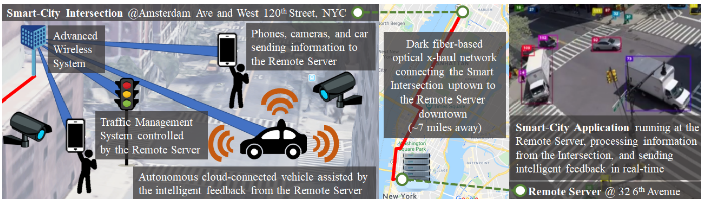
Figure 1: Illustration of a Smart-City Intersection leveraging the (actual) deployment of cameras and Software-Defined Radios (SDRs) in West Harlem and the data center in Lower Manhattan.

My interdisciplinary background and research approach (illustrated in Fig. 2) combining theory, machine learning (ML), and advanced wireless systems places me in a unique position to contribute to the development of next-generation communication networks. To develop network control algorithms that satisfy application-specific requirements in terms of data rates, latency, and/or information freshness, I use classical tools such as Renewal Theory [3–9], Stochastic Coupling [8–10], Dynamic Programming [8–12], Lyapunov Optimization [4–9, 13], Multi-Armed Bandits [6–10], and Model Predictive Control [1], as well as ML-based approaches such as Long Short-Term Memory (LSTM) models [1], Stochastic Bandit algorithms [14] (e.g., Upper Confidence Bound and Thompson Sampling), and Reinforcement Learning (in two ongoing projects). Then, to validate my solutions, I employ advanced wireless systems from the NSF PAWR COSMOS testbed , including