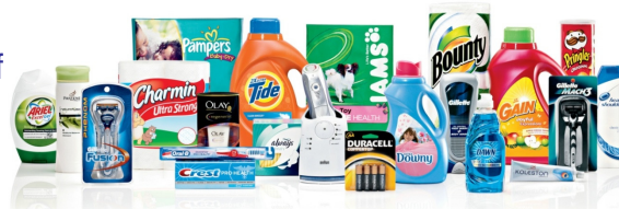
23 Billion-Dollar Brands

We provide branded products and services of superior quality and value that improve the lives of the world's consumers