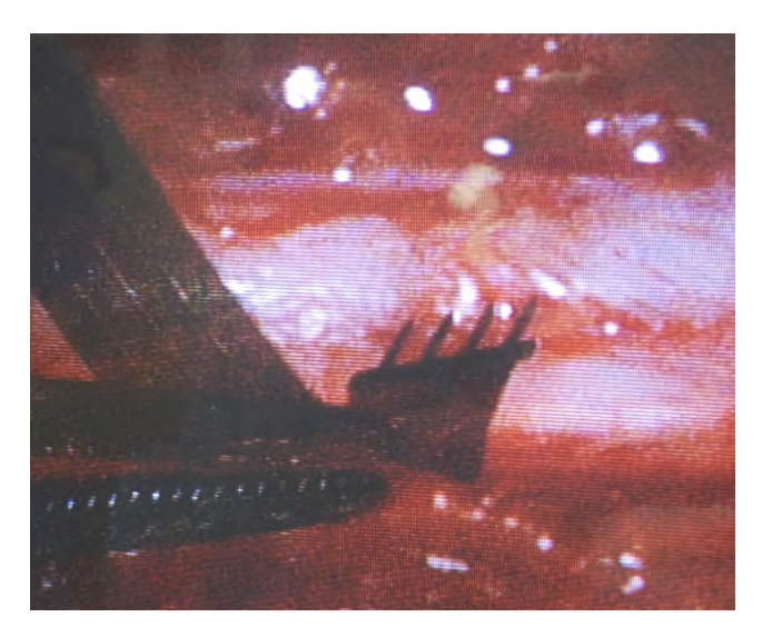
Fig. 2. Photo taken during a surgical implantation of a microelectrode array being inserted into the spinal cord of a cat. Center of photo shows the array, connected to flex cable, held by forceps under the operating microscope. Note that the array consists of four stalks, with eight individually addressable electrodes on each stalk.

the stimulation electrodes and the recording array and an estimated conduction velocity in the feline spinal cord of 69.61 m/sec, these responses correspond to the appropriate area. The peak-to-peak amplitudes varied from 87.5 \mu V to 423.8 \mu V with a mean amplitude of 130 \mu V. Upon removal of the electrode from the recording area the impedance was tested again. The mean impedance at this time was 131.1 \pm 37.3 k \Omega with five electrodes having impedances over 5 M \Omega .