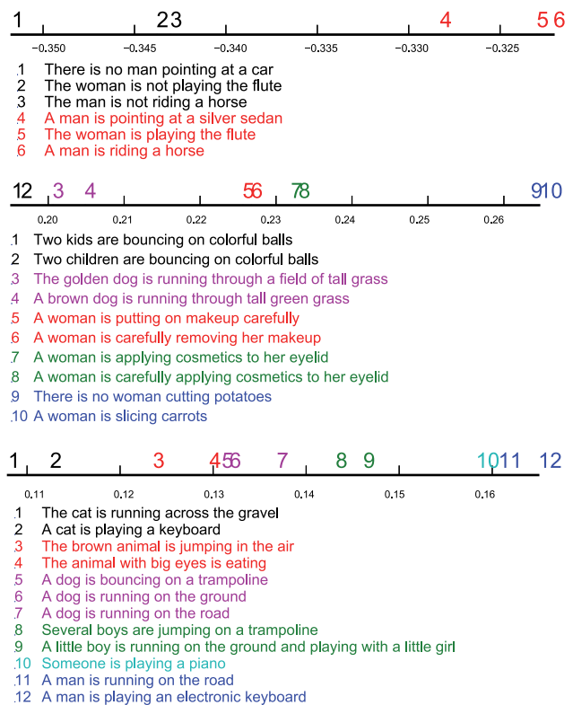
Figure 2: MaLSTM representations of test set sentences depicted along three different dimensions of h_T (indices 1, 2, and 6). Each number above the axis corresponds to a sentence representation and its location represents the value this particular hidden unit assigns to the sentence (shown below).

Next, we shift our attention from local characteristics of different hidden units toward the global geometry of the sentence representation space. Due to our training criterion, this space is naturally endowed with the \ell_1 metric and avoids being highly warped. While analysis of neural network representations typically requires nonlinear dimensionality re-