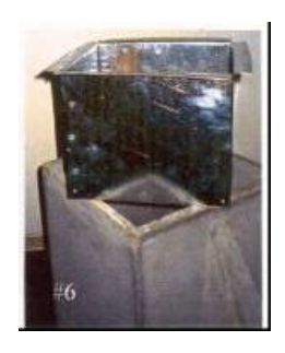
Fig 4. The water diffuser can be removed