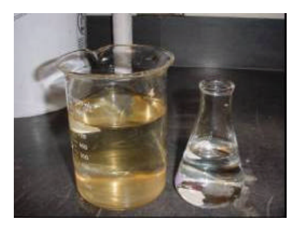
Figure 9. Comparison of raw water (left) and treated water (right)