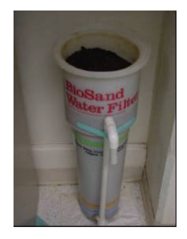
Figure 7. A prototype combined-filter