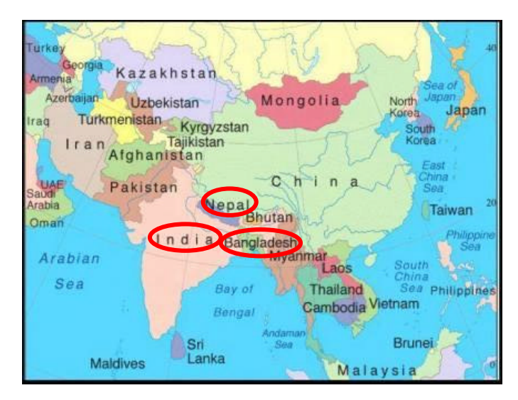
Fig 1. Map of Asia showing Bangladesh, India, and Nepal

The most recent UNICEF statistics shows 1.7 billion people in the world do not have access to safe drinking water. Of these 1.7 billion people, over 100 million lives in rural Bangladesh, Eastern India (West Bengal), and Nepal. Refer to figure 1 for a map showing these countries. In these developing countries, two of the most significant contaminants in the drinking water are arsenic and pathogens<sup>1</sup>.