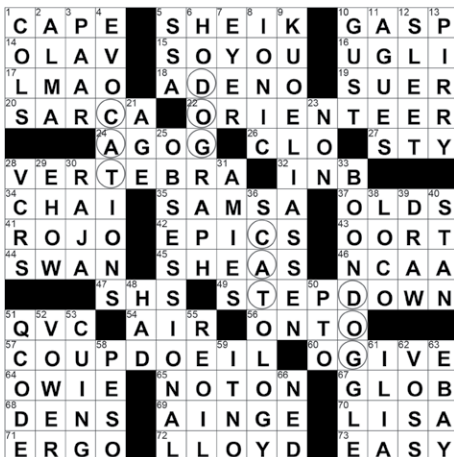
Answers to the puzzle on page 436.