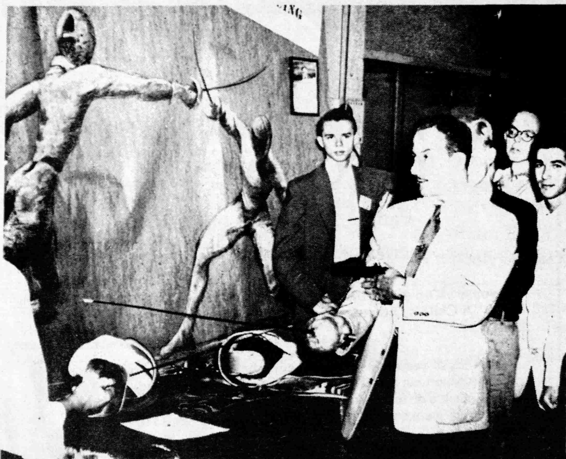
MIT's coach demonstrates the new winning "method"