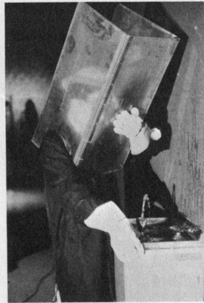
Incorrect method of fountain drinking (left) has been replaced by modern, improved, safe method (right).