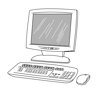
The ThinPrep® Imaging System