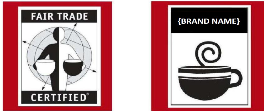
Figure 2: Treatment and Control Condition for the Price Test (3x3 inch)